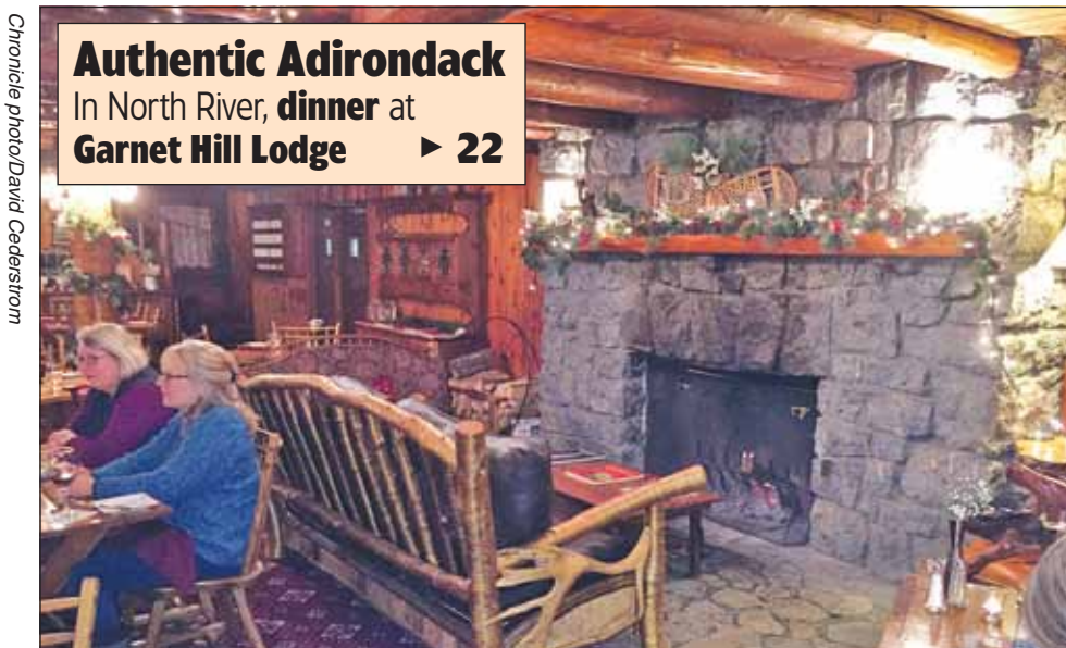
Authentic Adirondack In North River, dinner at Garnet Hill Lodge ▶ 22