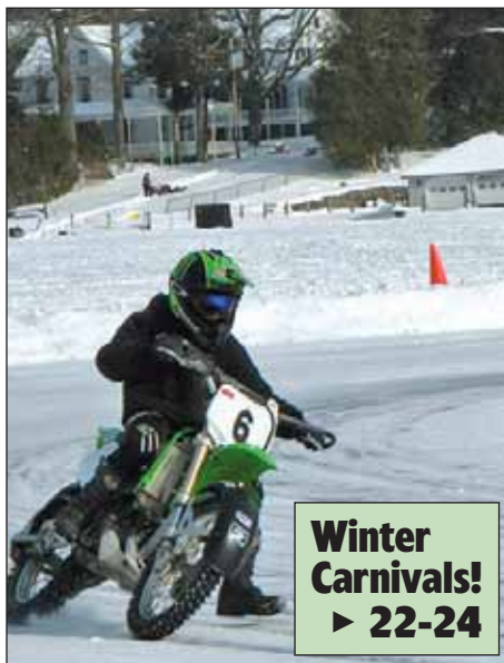
Winter Carnivals! ▶ 22-24