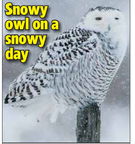
Snowy owl on a snowy day