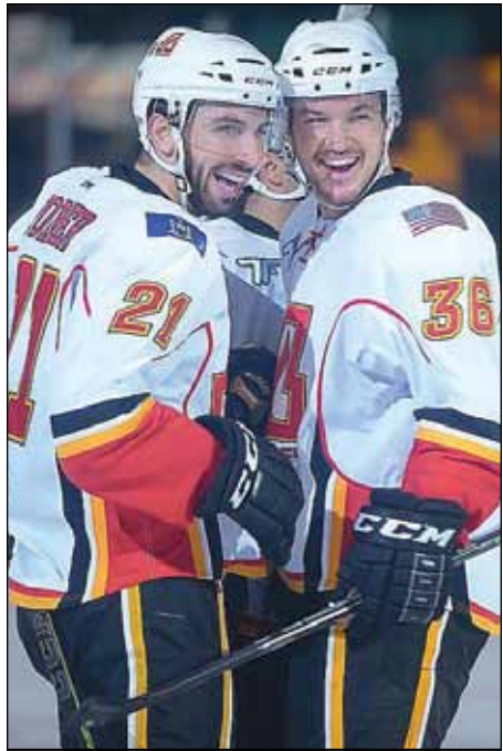
All smiles Adk. Flames photo/Andy Camp