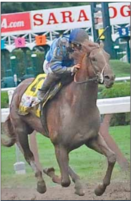
V.E. Day wins a Travers thriller ▶ 14