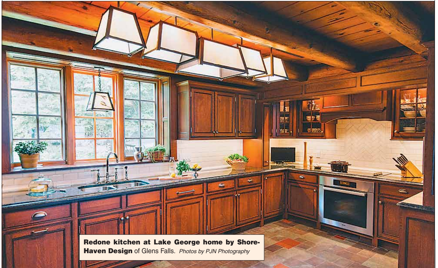
Redone kitchen at Lake George home by Shore-Haven Design of Glens Falls.