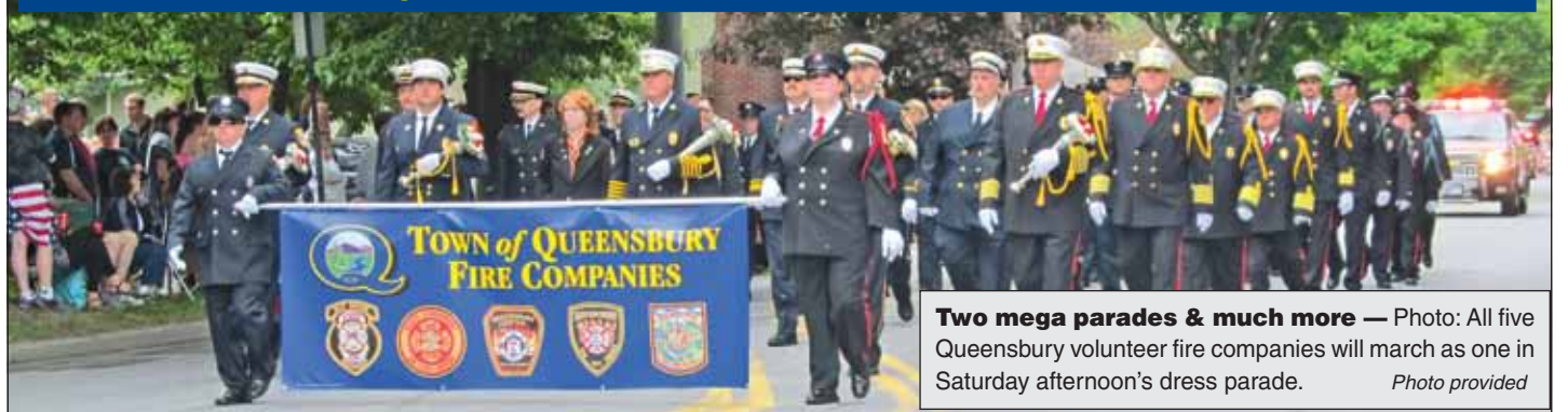
Two mega parades & much more — Photo: All five Queensbury volunteer fire companies will march as one in Saturday afternoon's dress parade.