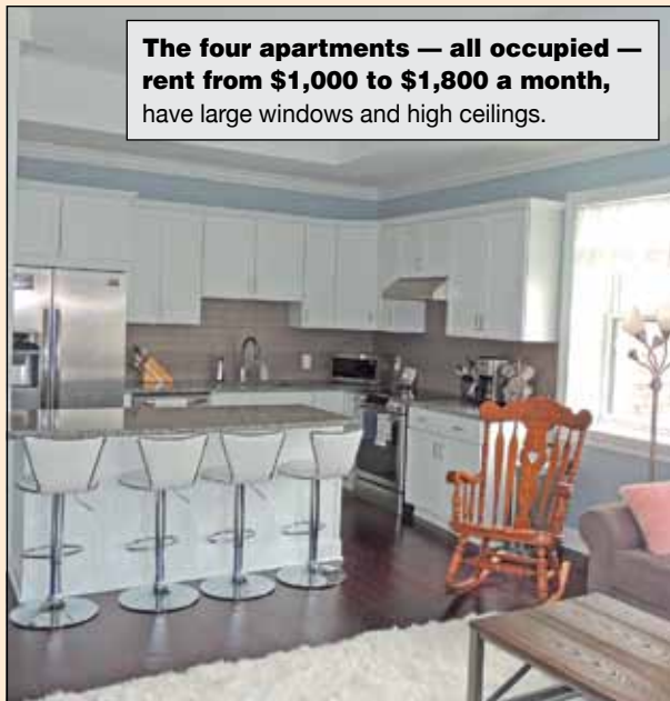
The four apartments — all occupied — rent from $1,000 to $1,800 a month, have large windows and high ceilings.