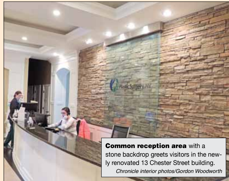
Common reception area with a stone backdrop greets visitors in the newly renovated 13 Chester Street building.

Cathy DeDe is enthused about step one in Craig Merrell's multi-faceted restaurant/bar venture in the B.B. Fowler building.