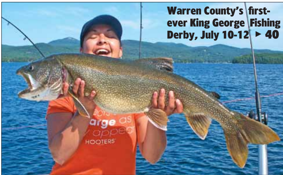
Warren County's first-ever King George Fishing Derby, July 10-12 ▶ 40