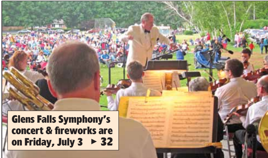
Glens Falls Symphony's concert & fireworks are on Friday, July 3 ▶ 32