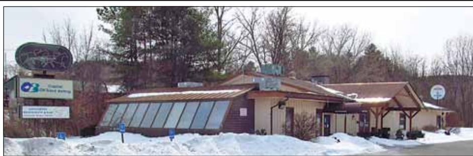
Top photo: Current OTB site. Lower photo: Artist rendering of renovated OTB building (left) and, at right, expanded Adirondack Pub & Brewery.